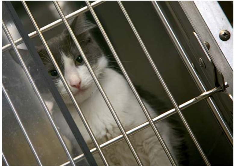
This friendly feline awaits sterilization at a SNAP clinic. SNAP has helped over 390,000 cats and dogs since it was founded in 1993.