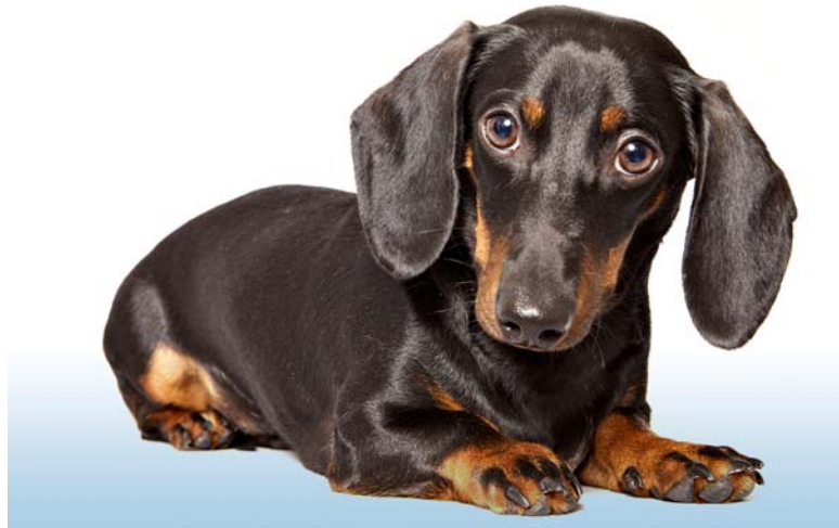
Dozens of adorable dachshunds were spayed and neutered at a dachshund-only event sponsored by ACS in San Antonio.